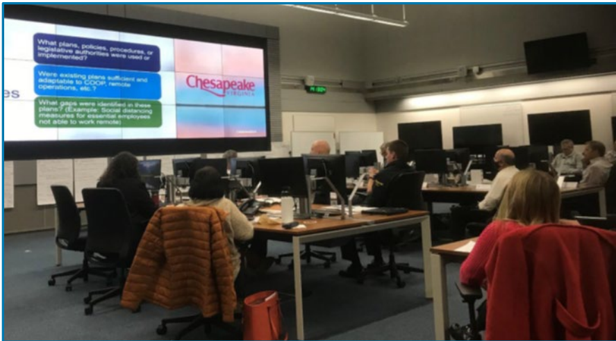
Community-Specific IEMC participants in the City of Chesapeake’s EOC

“The most recent IEMC experience was the 2022 Tri-Cities (Chesapeake, Norfolk, Virginia Beach) course and exercise series. EMI developed course work geared toward the Policy Team levels of the three cities to facilitate a self-assessment of collaboration, coordination, and communication capabilities in a variety of incident types. City Managers, their deputies, emergency management personnel, and key department heads discussed scenarios and questions individually to identify priorities, gaps (needs improvement), and strengths. The three cities then returned to share their respective findings.”