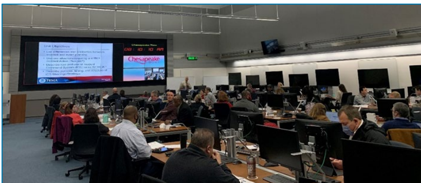
Community-Specific IEMC participants in the City of Chesapeake's EOC

"The City of Chesapeake stresses continuous improvement as a cornerstone in its efforts to prepare for emergencies. Since 2015, the city has worked in partnership with the Emergency Management Institute (EMI) and its subject matter experts as part of the Integrated Emergency Management Course (IEMC) process. The course work and exercises developed as part of IEMC evolutions, both within and outside the city, have helped to prepare leadership and responders for the gamut of emergencies (flooding and storms, protests, etc.) that have touched our community over these past seven years."