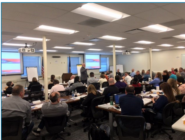
Community Specific IEMC Students in the classroom at EMI

The Community-Specific IEMCs provide an ideal preparedness opportunity for all stakeholders in your community to become more familiar with your EOC plans policies and procedures. Course topics and agenda are determined by the community and are presented by IEM Branch instructors, community representatives, and state subject matter experts in a safe training an exercise environment.