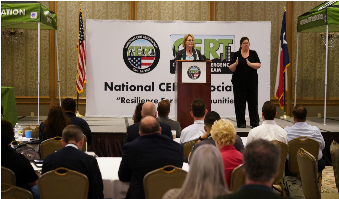
FEMA Administrator Delivers Keynote Address at the 2022 CERT Conference

As part of the pre-conference training at the August “Taking CERT to the Next Level” conference, EMI delivered the CERT Program Manager and CERT Train-the-Trainer (T-t-T) classes, graduating 31 students from the Program Manager class and 29 from the T-t-T.