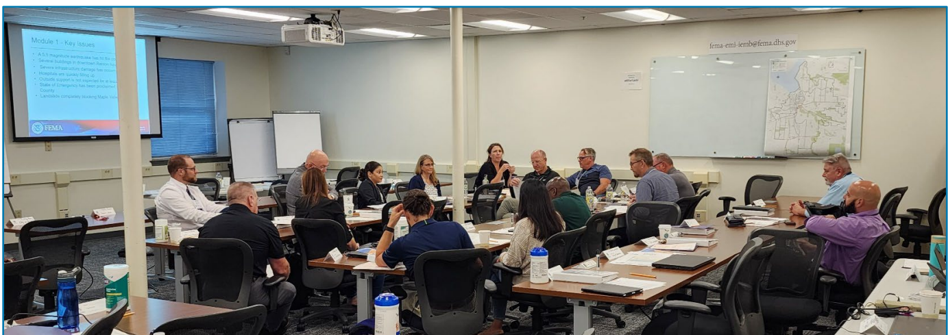
Community Specific IEMC Students in the classroom at EMI

Community-Specific IEMC: The EMI’s Community-Specific Integrated Emergency Management (IEM) Branch is responsible for this nationally recognized flagship program. The IEMC is designed to give Emergency Operations Center (EOC) personnel a realistic opportunity to build awareness and skills necessary to prepare for and respond to a simulated emergency event using the jurisdiction’s own plans, policies, and procedures, in a no-fault learning environment. The IEMC is four-days of classroom instructional modules, discussions, small-group planning sessions, and exercise-based training activities for EOC personnel, to practice simulated, but realistic crisis situations, within a structured learning environment.