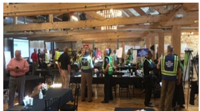
Photo: IEMC course delivery in Grand Rapids, MI