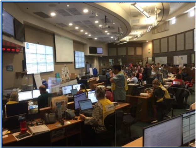
Photo: IEMC course delivery for the State of Nevada

If one of these communities is in your Region, you may be hearing from us shortly. As we work with each community building out the course topics and agenda, often the community may ask for direct FEMA Region support. What does this support look like? Sometimes the support is in the form of a presentation on Long-Term Recovery or Debris Management; sometimes it is an ask for an SME on Disaster Recovery Centers. The IEMCs provide an ideal preparedness opportunity for all stakeholders. Don't miss out on the chance to make a community more resilient, in person.