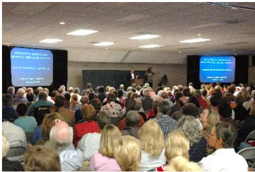
Photo: Public meeting.

The public (residents, businesses, and other interested parties) needs the opportunity to ask questions, make suggestions, and comment on the hazard mitigation plan during the drafting stage and prior to plan approval. Provide opportunities for neighboring communities, agencies involved in hazard mitigation, businesses, academia, and other relevant private and nonprofit interests to be involved as well. Citizens who become knowledgeable about the initiative may be willing to assist later in the implementation process.